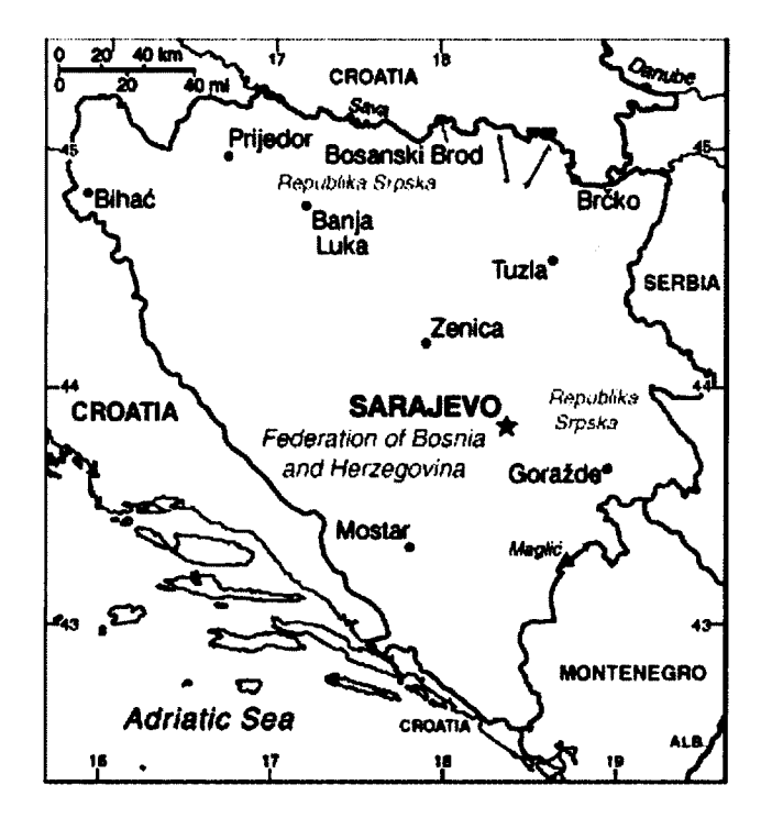
Figure 1. Map of Bosnia-Herzegovina