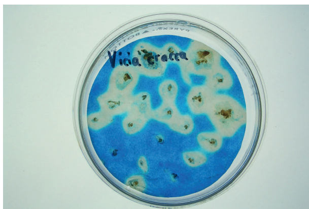
Figure 1. Hup + root nodules of Vicia cracca as evidenced by presence of white bands post H 2 incubation with methylene blue assay solution.