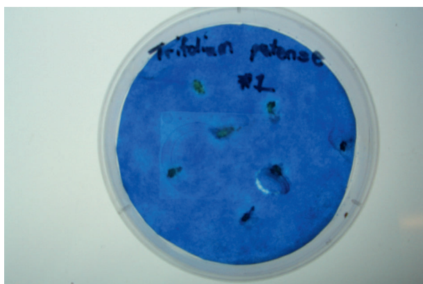
Figure 2. Hup - root nodules of Trifolium pratense as evidenced by the absence of white bands post H 2 incubation with methylene blue assay solution.