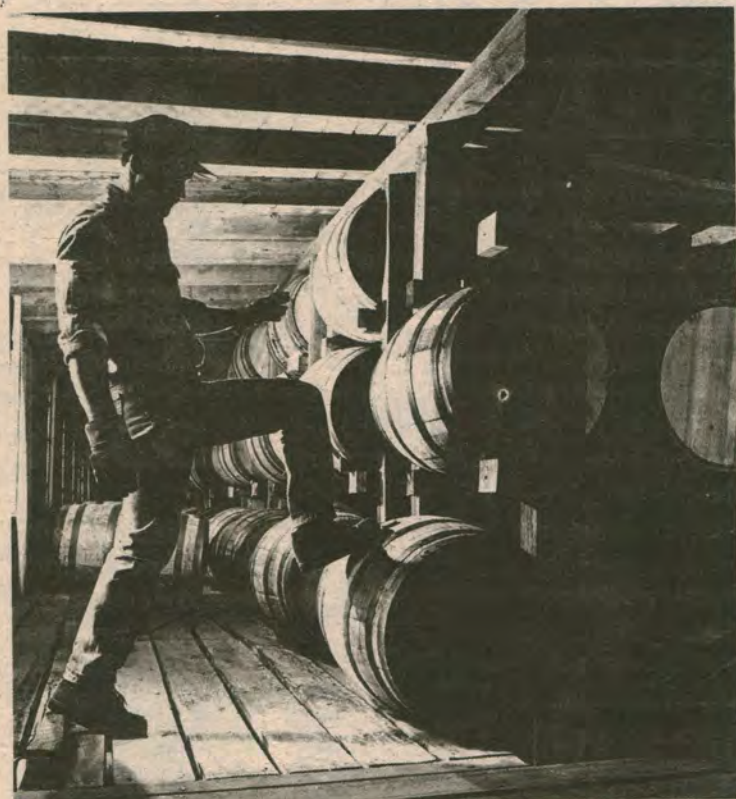
If you'd like a booklet about Jack Daniel's Whiskey, write us here in Lynchburg, Tennessee 37352, U.S.A.