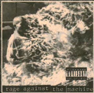
RAGE AGAINST THE MACHINE