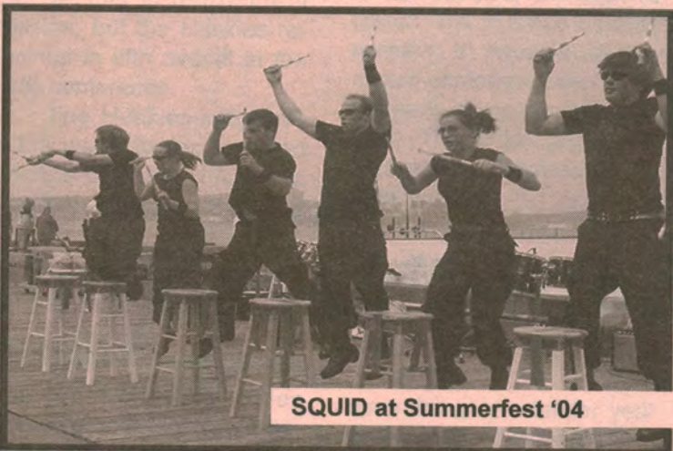
SQUID at Summerfest '04