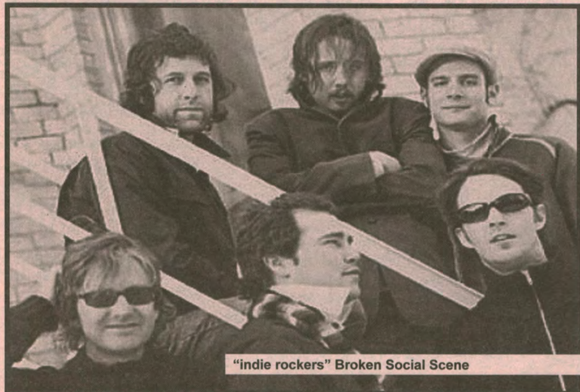
"indie rockers" Broken Social Scene