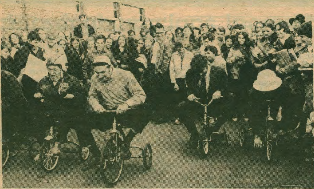
The Federal Election race is on...