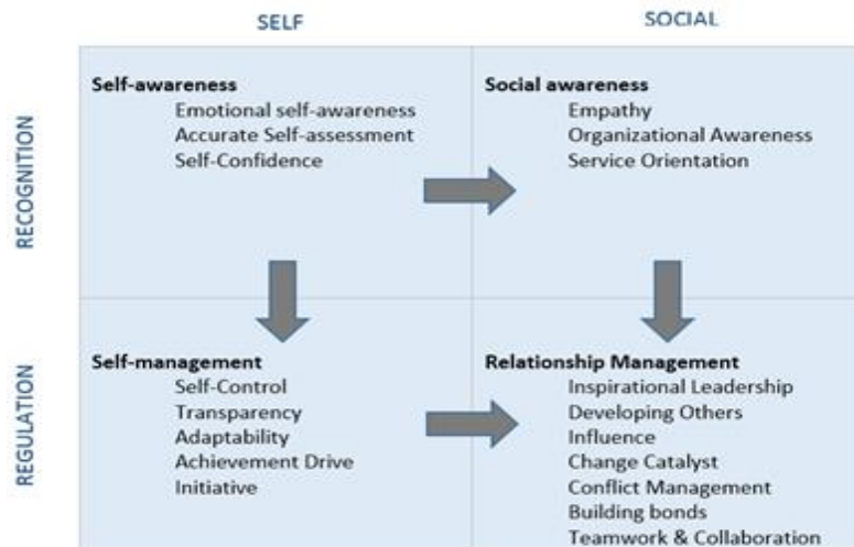
Figure 4: Goleman’s Emotional Intelligence Framework