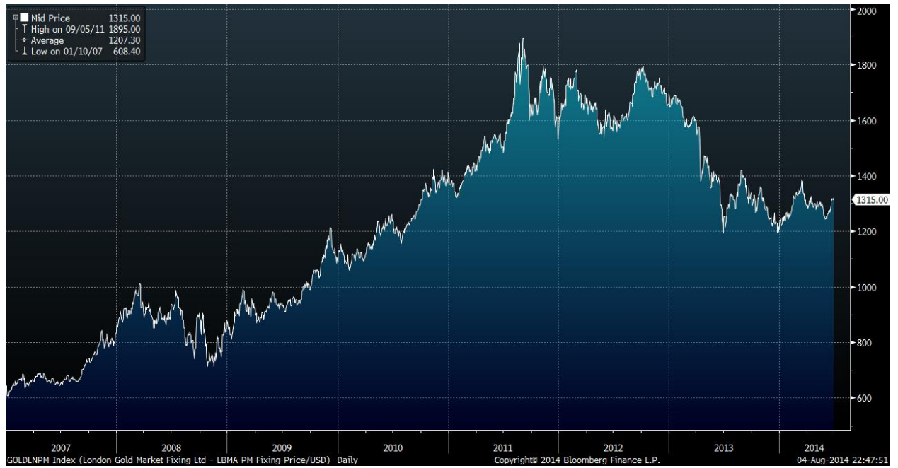
Source from Bloomberg web page