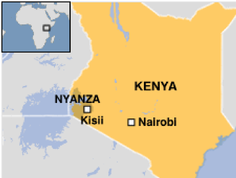
4.6: Map of Kenya showing position of Kisii near Lake Victoria in Nyanza Province

Note. Figure reproduced from: https://www.bing.com/images/search