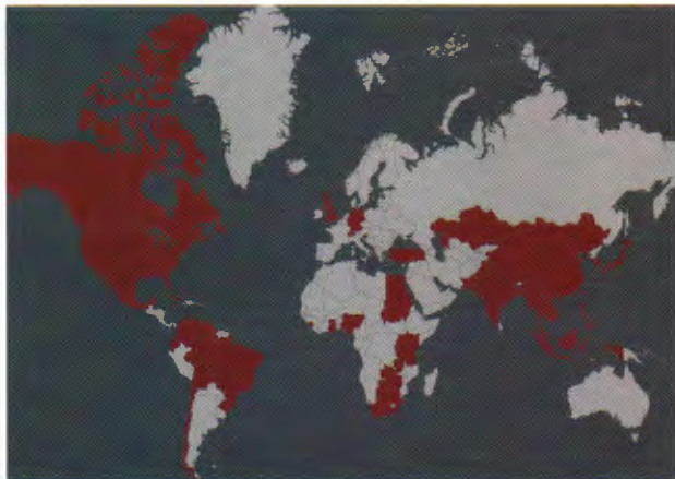
The impact of the IDS program is worldwide.