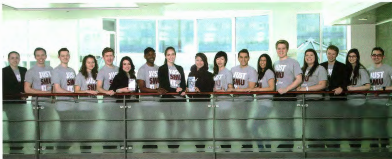
2015 Enactus Team

GET CAUGHT UP ON CAMPUS NEWS, RESEARCH, AWARDS, AND NOTABLE ACHIEVEMENTS AT SAINT MARY'S.