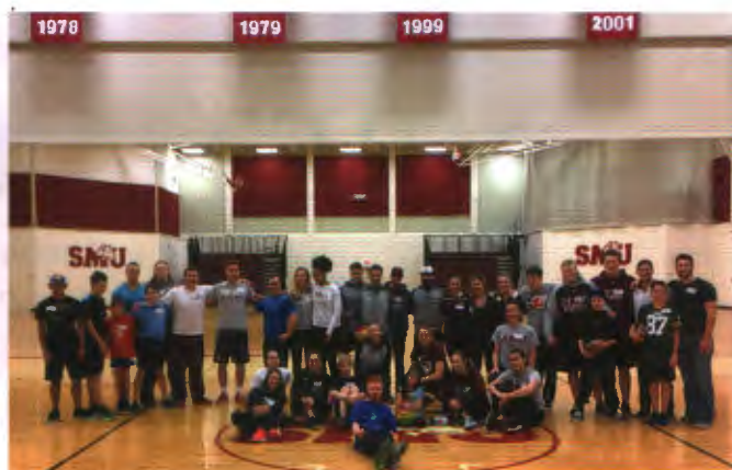
Huskies Move for Inclusion taking part in RBC FanFit Community Event in March 2017 at the Homburg Centre.

time building physical literacy for local children living with exceptionalities so they can learn to be active.