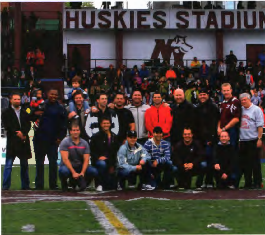
Vanier Cup team members celebrate a reunion gathering in 2011.