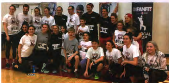
Huskies Move for Inclusion taking part in RBC FanFit Community Event in March 2017 at the Homburg Centre.