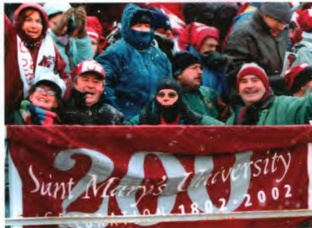
Spectators watch a championship game in 2002.

These deep friendships allowed players to overcome individual ego and individual goals for the common