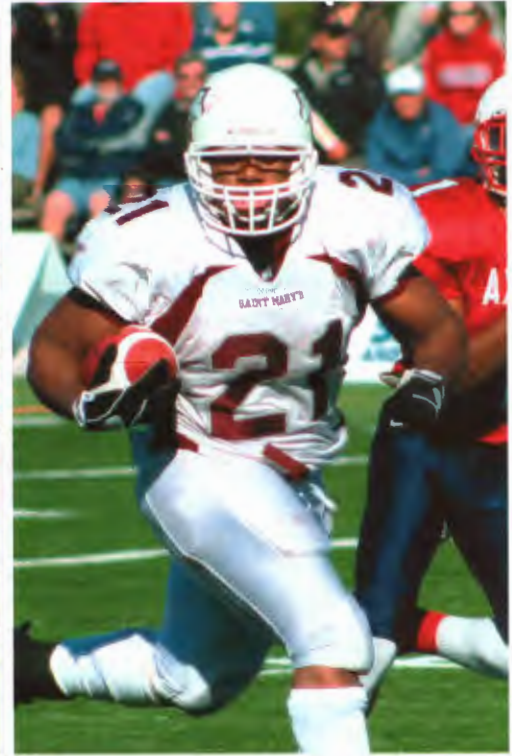
The face of fierce determination.

Consider the numbers. In the 2001 regular season—the perfect year—the team outscored the opposition 480-35. In the post season, they outscored opponents 128-31. In the Vanier Cup, the score was 42-16 over Manitoba.