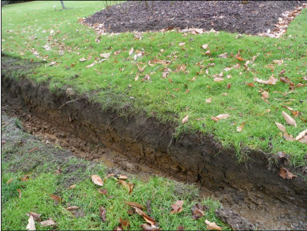
Plate 3: West wall profile of the trench north of the light standard, looking southwest.