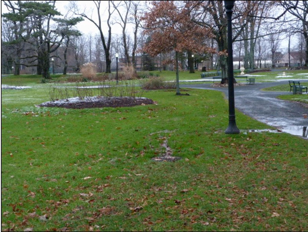
Plate 1: Location of the trench prior to excavation, looking north.