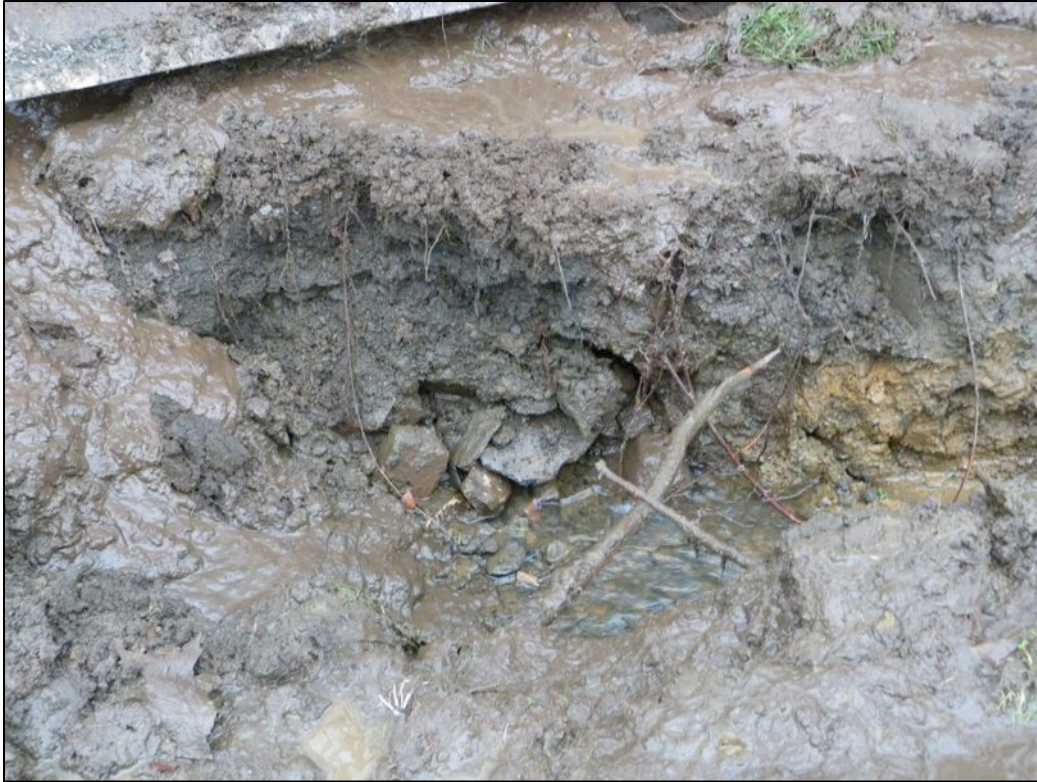
Plate 7: East wall profile of the trench where the rivulet cuts across it. The watercourse appears to have been in-filled with brick and stone.