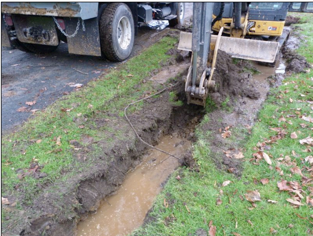
Plate 4: A lead electrical conduit can be seen in front of and beside the excavator bucket (looking south southeast).