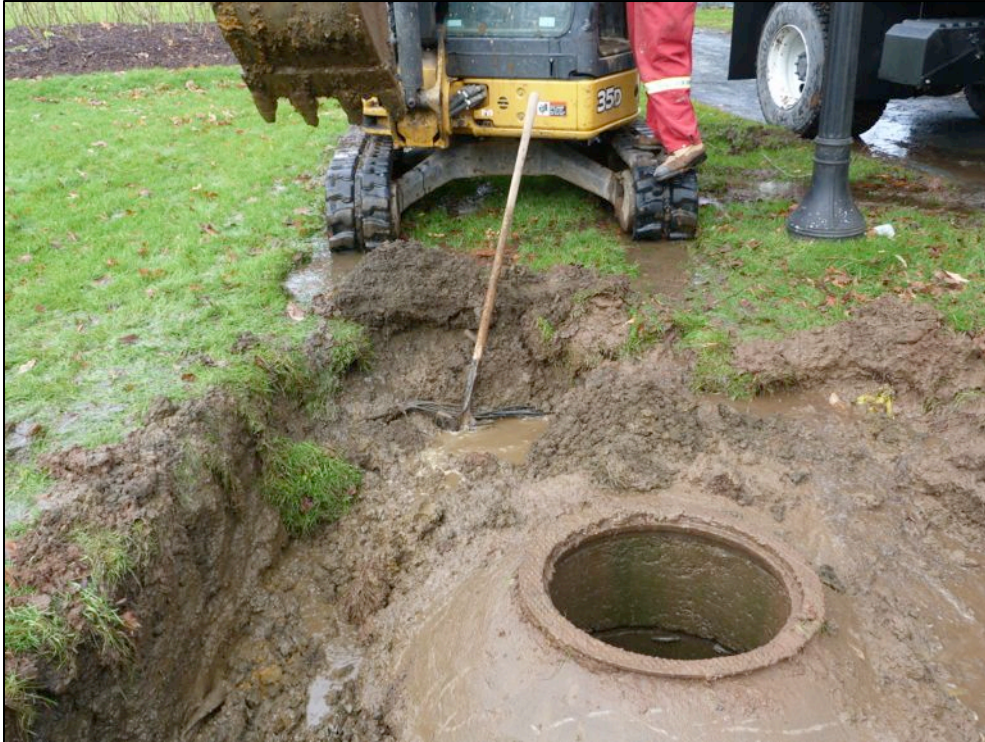
Plate 5: Beginning of excavation at the south end of the trench at the catch basin. An older French drain was installed on the west (left) side of the catch basin (looking north). Exposed electrical wires can be seen just in front of the excavator and are being secured in place by the upright shovel.