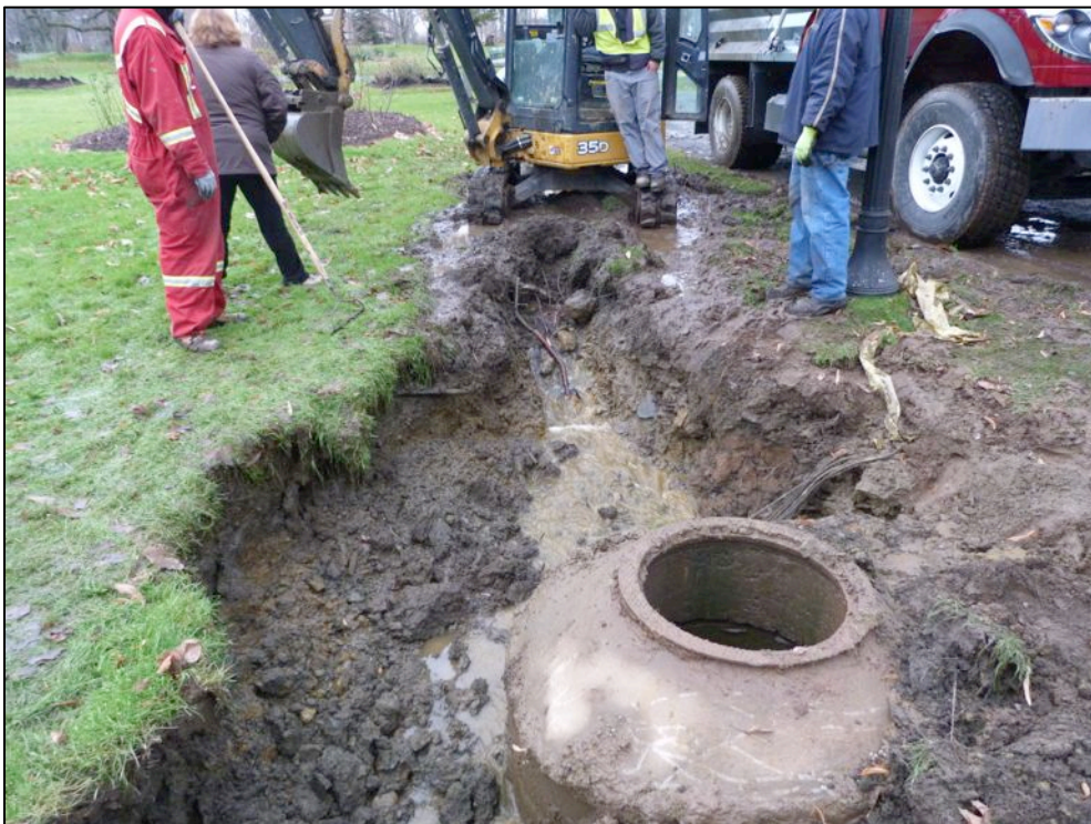
Plate 6: The south end of the trench showing the rivulet (at the far north end of the excavated area) draining out (looking north).