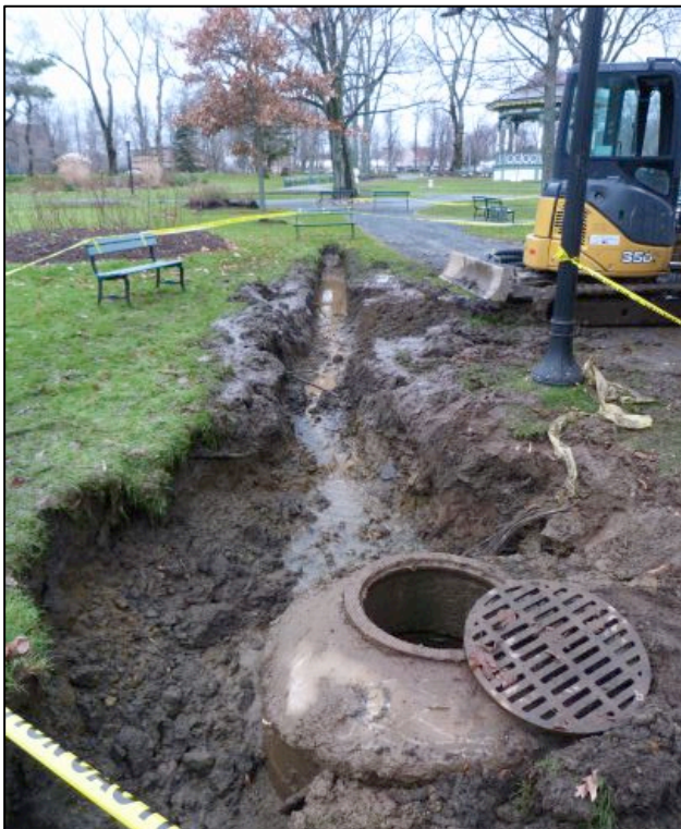
Plate 2: The trench after excavation, looking north.