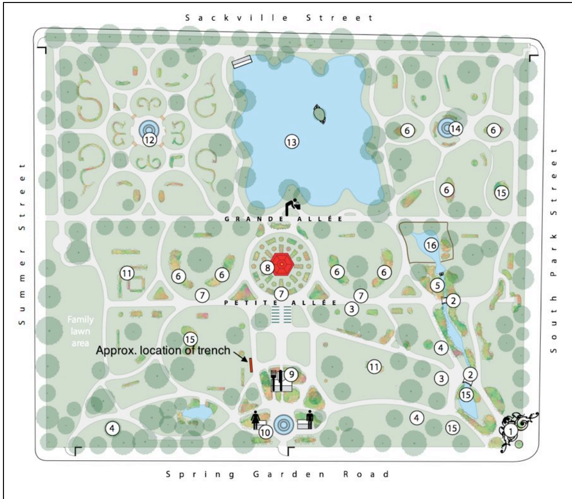
Figure 2.0-1: Map of the Halifax Public Gardens showing the approximate location of the excavated trench.