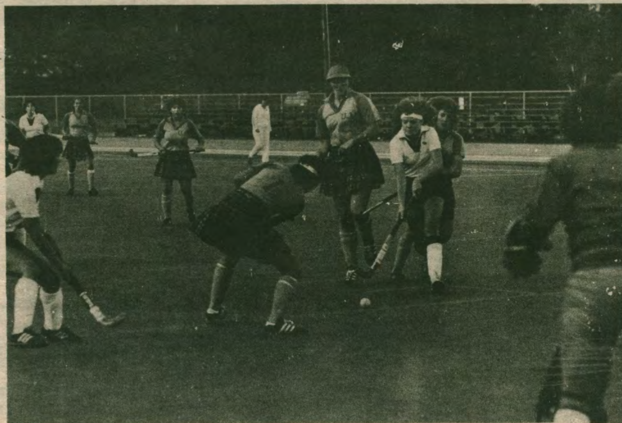
The Field Hockey team in action in a home game last week against the Universite de Moncton Blue Angels. The team will have a busy schedule this fall competing for the AUAA title.