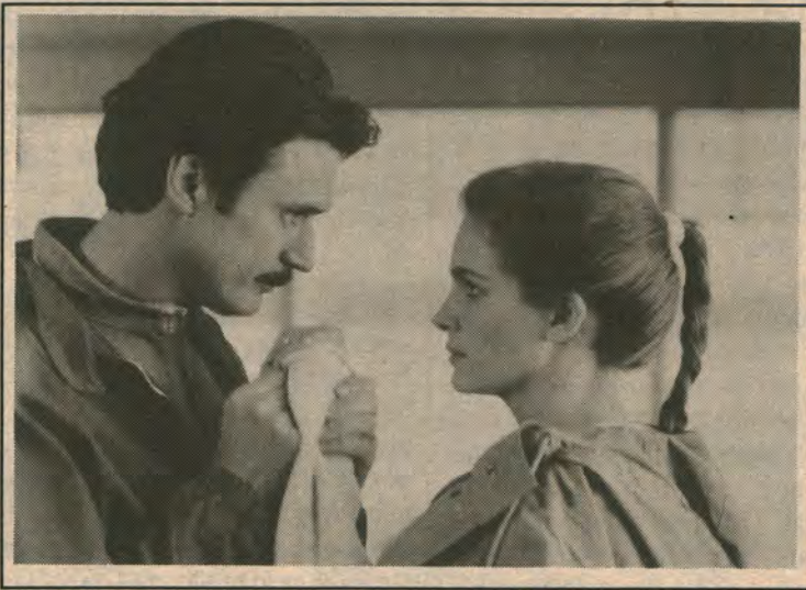
Patrick Bergin and the beautiful Julia Roberts star in the poorly directed thriller, Sleeping With the Enemy .

guy, (played very badly by B.J. McKay wannabe Kevin Anderson) visits her sick mother, who she loves oh so much, for the first time in months and finds perfect happiness.