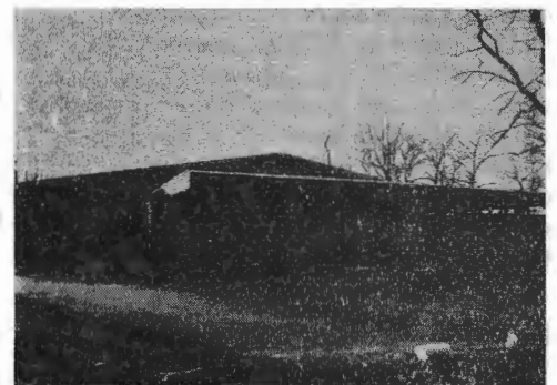
Winter Arena and Sports Center