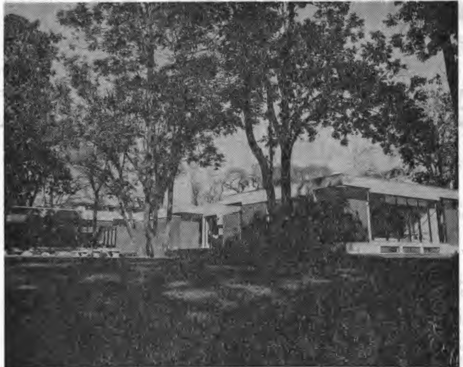
THE NEW STUDENTS CENTER

At the executive meeting held the same night four resolutions were proposed and adopted.