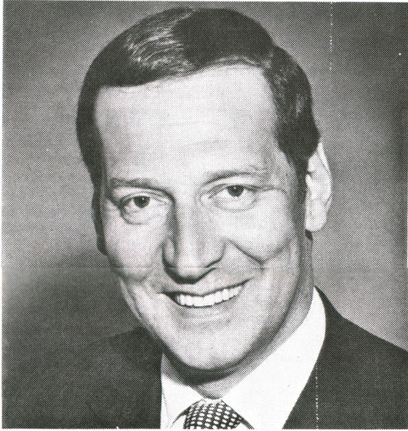
Premier Gerald Regan