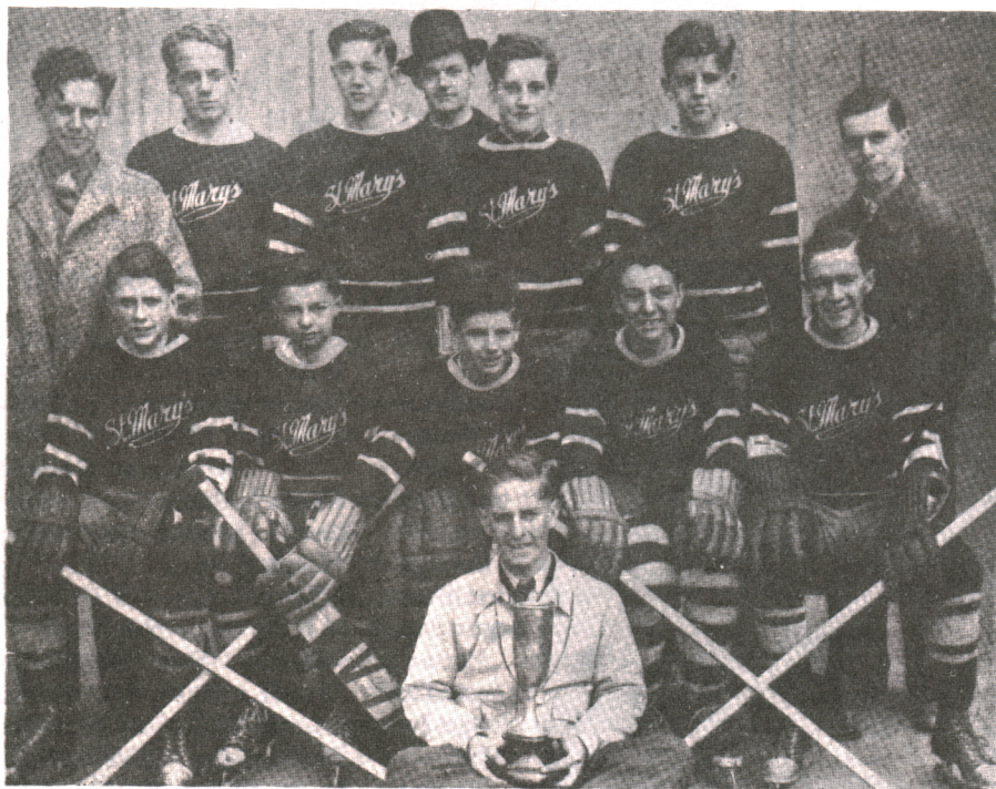
CITY JUNIOR HIGH CHAMPIONS