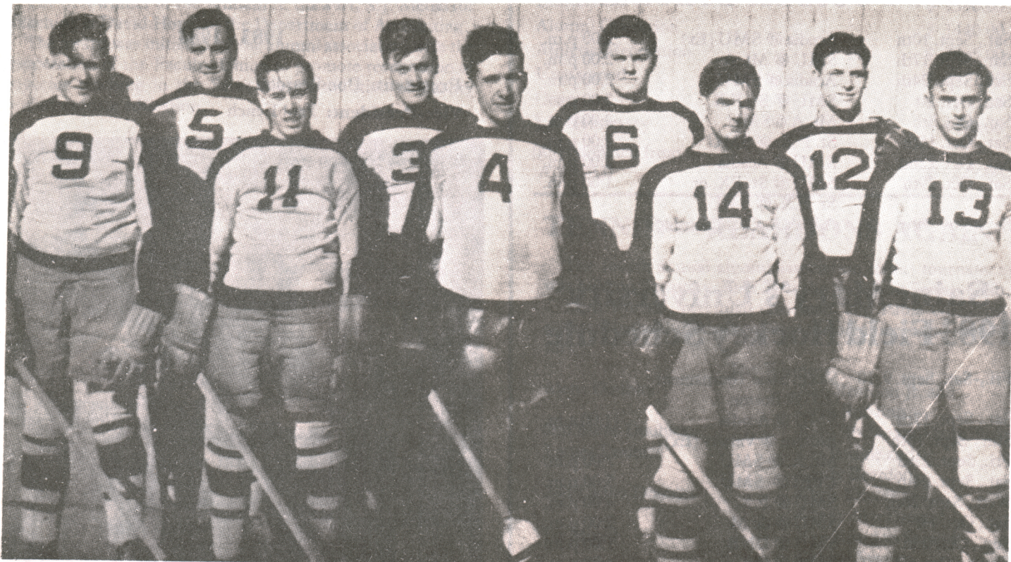
CITY SENIOR HIGH CHAMPIONS