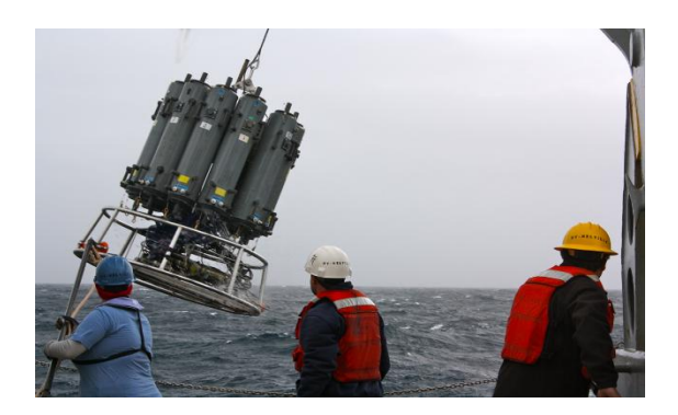
Figure 4: Oceanographers deploying a CTD; a device that's used to measure the Conductivity (salinity), Temperature and Depth of seawater.<sup>4</sup>

The types of micro particles present in water may vary. Measuring trace contaminants in water is a challenge as they normally appear in very low concentrations. Accurate measurements require collection and filtration of large volumes of water with suspended particles (sediment) in order to collect enough material for analysis.<sup>5</sup> Monitoring of micro-particles in-situ and in real time will be of great convenience and value to researchers.