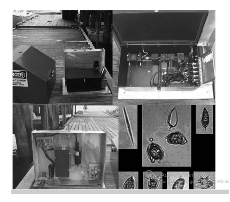
Figure 5: Docktop flow cytometer and microscope (FLOWCAM) system developed, Fluid Imaging Technologies<sup>9</sup>

cytometer and microscope (FLOWCAM, see: fig.5) The most rapidly growing area of HAB species detection involves the targeting of specific molecules, such as chemical moieties located on the cell surface and various components of an organism's genome. These classes of molecules lend themselves well to detection by antibody or oligonucleotide probes, respectively, using methods derived from previously developed biomedical applications.<sup>9</sup>