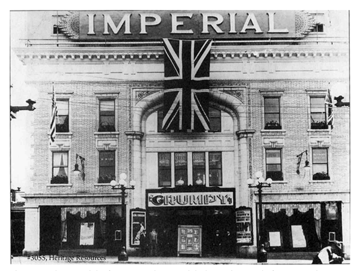
Figure 2 - The Imperial After WWI: The Imperial Theatre in 1920 before any major changes happened to the building. (Heritage Resources #3055)

pit, to provide live music accompaniment to the silent films; Golding was one of the first to use this technique (SJ 2). In this time, when actors and actresses travelled all over, few acts missed the Imperial; it housed performances by people from New York, Boston, Los Angeles, England, France, Germany, and more (SJ 2). When WWI began, the Imperial did its part. As a recruiting centre it provided the space to enlist three regiments, entertainment was free for members of the forces and their families and the theatre raised $140,000 in war bonds (SJ 2; SJ 4). When coal was short in supply and the Imperial impossible to heat, films were shows outside on the front of the building (SJ 2; SJ 4).