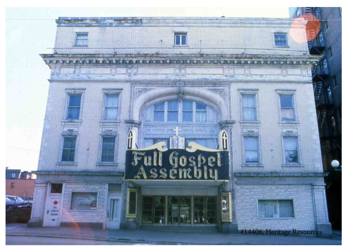
Figure 3 - The Full Gospel Assembly: The Imperial-Capitol in 1983 as the Full Gospel Assembly, before the Bi-Capitol Project Renovations.