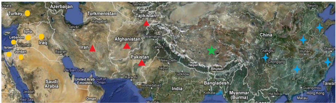
Figure 1. The geographic distribution of sampled four barley nature populations: Southwest Asian wild barley (●), Central Asian wild barley (▲), Tibetan wild barley (★) and Chinese domesticated barley (✦). doi:10.1371/journal.pone.0062700.g001

protein content regulation, and loss of functionality of the NAM-1 gene is related to lower grain protein content in Hordeum [34].