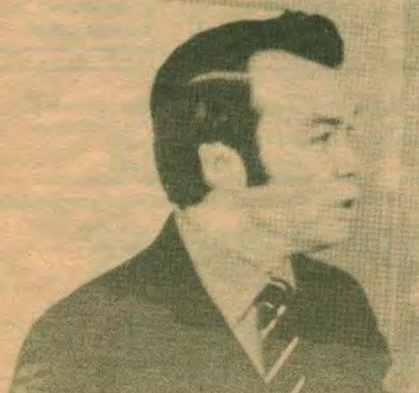
Bill Baird, director of the Parents' Aid Society crusader in the fight to legalize abortion and teach birth control.