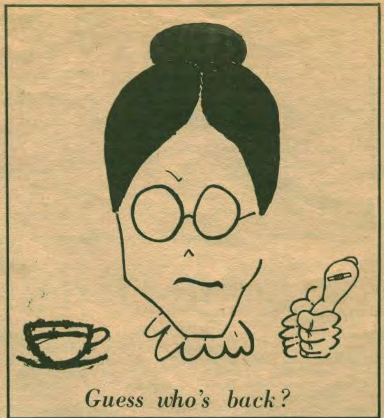
Guess who's back?

If you want a real charge build yourself an electric chair.