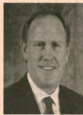
Gary Bettman & Bobby Goodenow, for the second consecutive week,