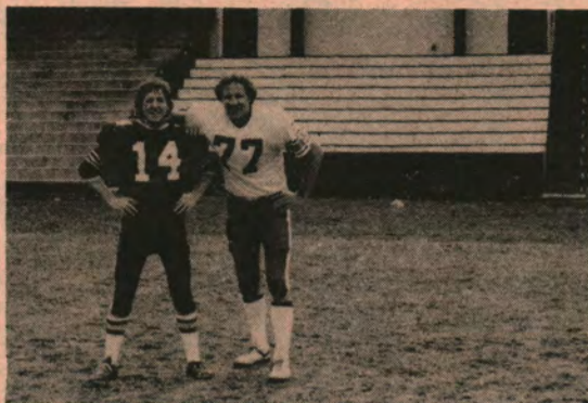
If these guys look familiar—they should! Wearing Huskies No. 14 is John Allen Cameron, while in his own Ottawa Rough Riders No. 77 is Tony Gabriel. The pair were working out at Saint Mary's Huskies Stadium recently, taping a segment for the upcoming CBC-TV summer series, 'The John Allen Cameron Show'.