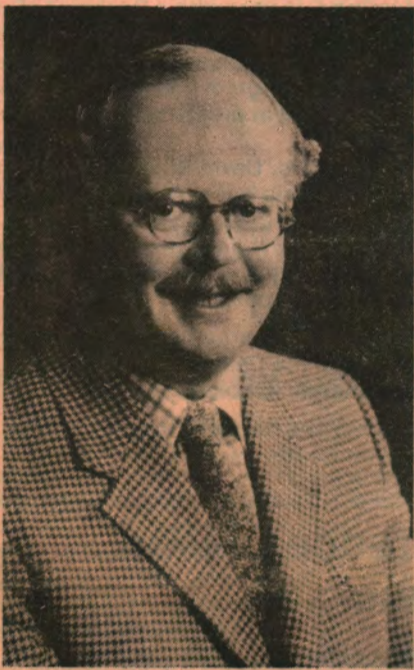
The Earl of Elgin and Kincardine