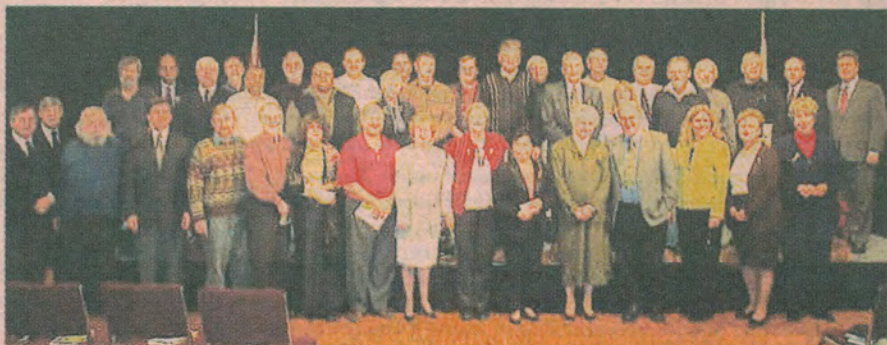
A total of 44 Saint Mary's University employees were honoured for their years of service at the 12th Annual Employee Recognition Awards which took place on November 23, 2005. All those in attendance posed for a group photo.