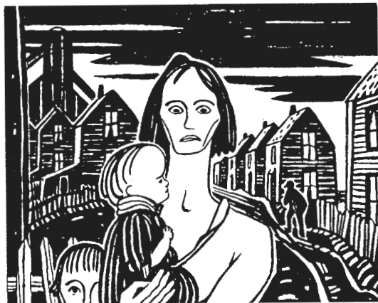
Glace Bay , a block print by Lawren S. Harris (1885-1970) is one of 150 striking works portrayed in Industrial Images/Industrial Imagination .

In conjunction with the exhibition, the art gallery has planned a symposium for Oct. 1 from 9:30 a.m. to 3:30 p.m. Entitled Hidden Work, Hidden Workers , it will look at the ways in which work and workers are portrayed, with a focus on Atlantic