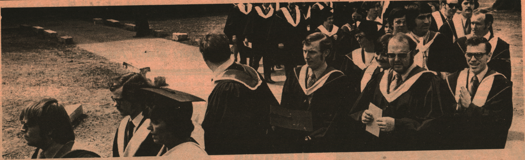
Part of Academic Procession at Convocation May 8, 72.