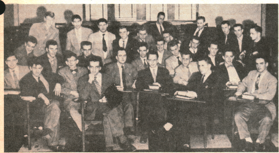
Class of 1954

While the table host system will be continued, additional opportunities are being provided for single and double reservations. Alumni need not wait for invitation by a table host, but may purchase tickets and make reservations through the Alumni office. Call Anne Uteck, 422-7361, local 150.