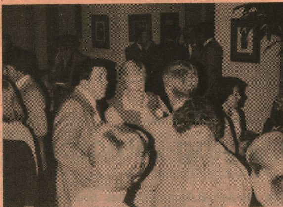
Toronto alumni in conversation.