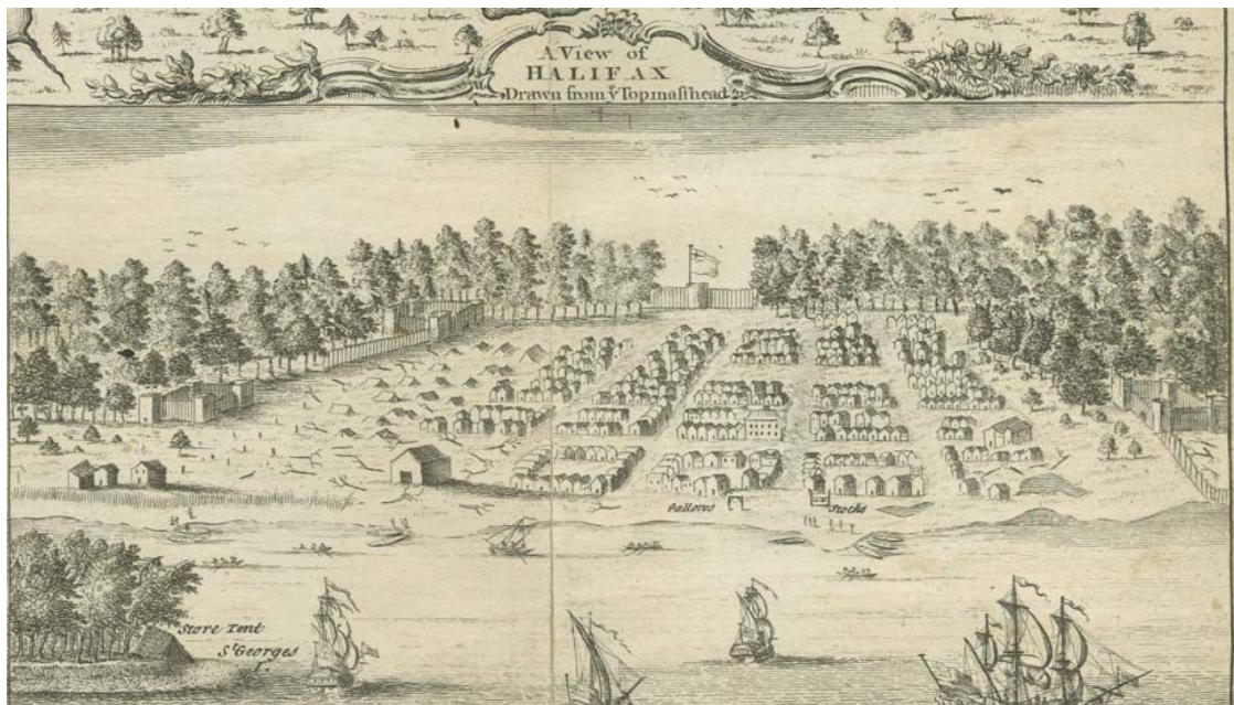
Figure 1. NSA, T. Jeffreys, Untitled Map of Halifax (London, 1750) Early map of British colony, Halifax. Map published in London to illustrate British North American colony (Creative Commons).

the colony, making it both relatable and attractive to the English reader (Lennox 2007, 408-409). The image (figure 1) gives the viewer a sense of a British community being established, as it depicts building construction, wall development, the British flag and several ships coming into the harbour. The image illustrates Halifax as a safe and developing British colony that was not isolated from the rest of the empire. These features are the main points of the image, but when viewed a little more closely Britain's further objectives for the society can be found. On the beach of the settlement there are two small illustrations along with the words 'gallows' and 'stocks'. This depicts the place where individuals of the settlement were hanged and publicly humiliated when found guilty of a crime. These small pictures show the British ideals of what makes an orderly and civilized British society. Including these small images further illustrates to the viewer the systematic similarity to the mother country and the authoritative order that has already been established.