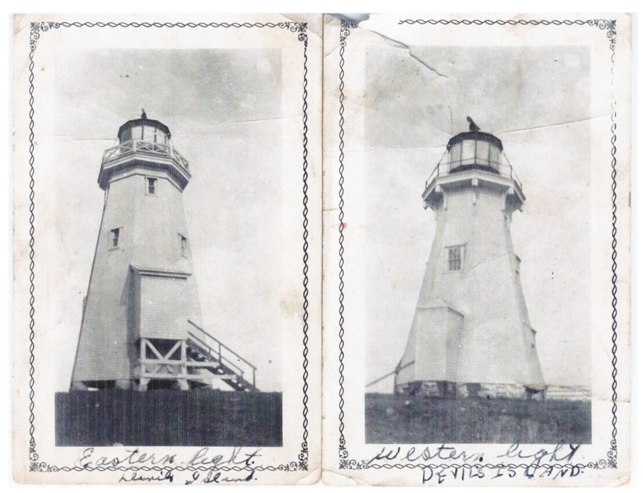
Eastern and Western Lighthouses