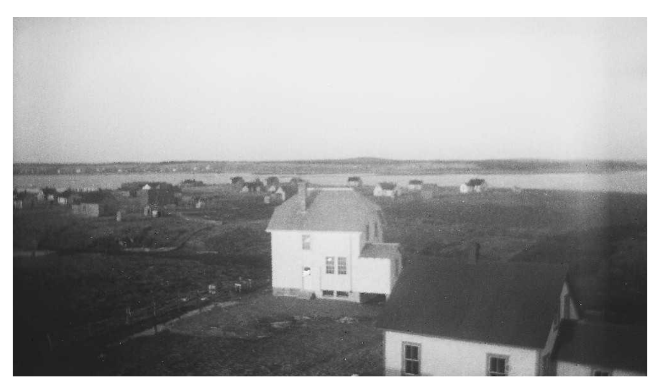
View from the Eastern Lighthouse