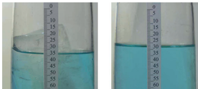
Figure 3. Composite of initial and final state photographs. (left-hand panel) pre-melting and (right-hand panel) melted.