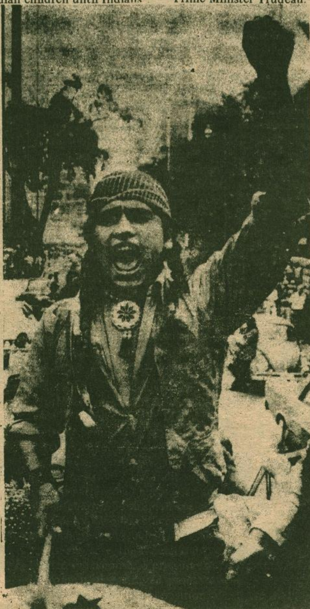
The Native Mood on Parliament Hill Before Sit-in.

The recently released secret documents do not make known many startling new facts. But they do provide an important overview of the federal government's manner of handling native demands for their rights and they show that the cabinet very much wants to keep the native claims out of court so any negotiations that take place will be on the government's terms.