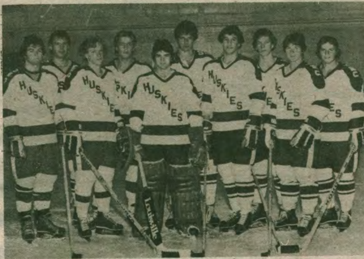
HUSKIE NEWCOMERS 80-81

serious run at the A.U.A.A. title this year, relying on the combined efforts of both their returning players and newcomers. Experience will be the key in their campaign, and