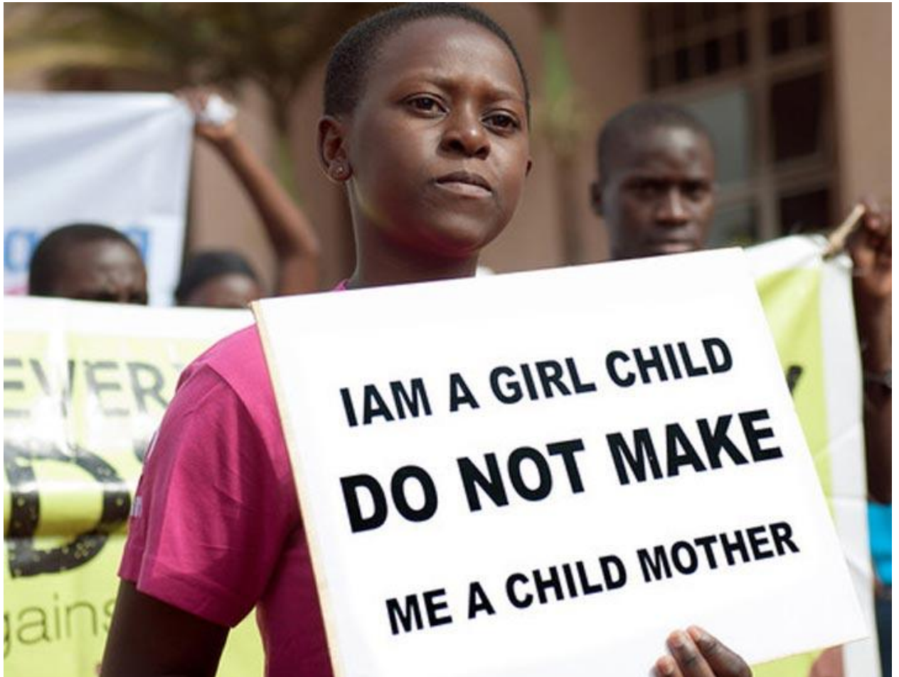
Girl protesting against child marriage