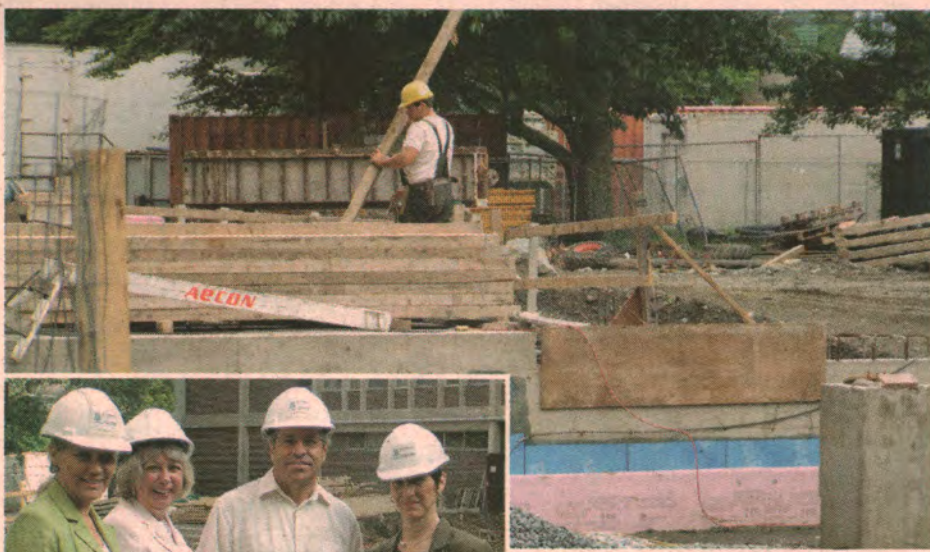
Above: Construction began on the Atrium Project this summer.