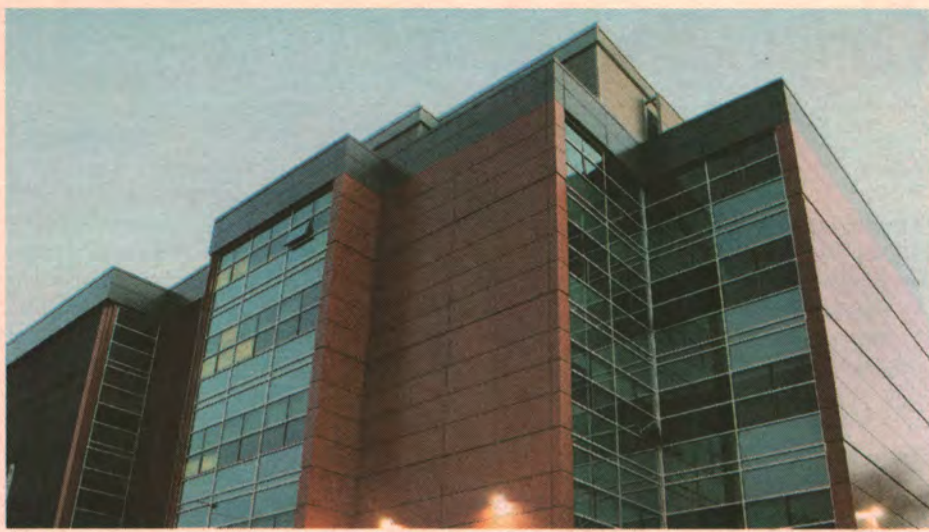
Saint Mary's newly renovated Science Building opened for studies last spring.