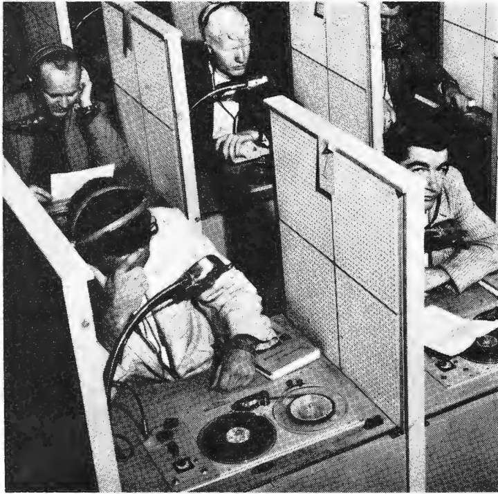
SMU's Language Laboratory