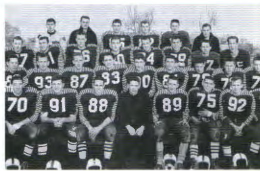
The 1956 Saint Mary's University Football Team